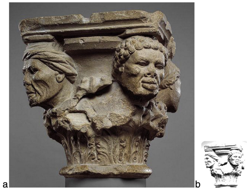
Fig. 2. a. Capital with Four Heads, ca. 1230. Southern Italy, Apulia, probably Troia. Limestone. The capital depicts four people representing Medieval population of Apulia (a man, a woman, a black man, and a moor), the study acronym (C)ardiovascular Prevention wIth Telecardiology in Apu(L)ia and logo (b).