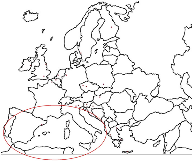
Fig. 1. EUROASPIRE II participating centers map: no center is available from southern "bare-Mediterranean" areas of Italy (and Western Mediterranean basin).

Cox regression. Statistical significance will be claimed if the overall P value is \leq .05 .