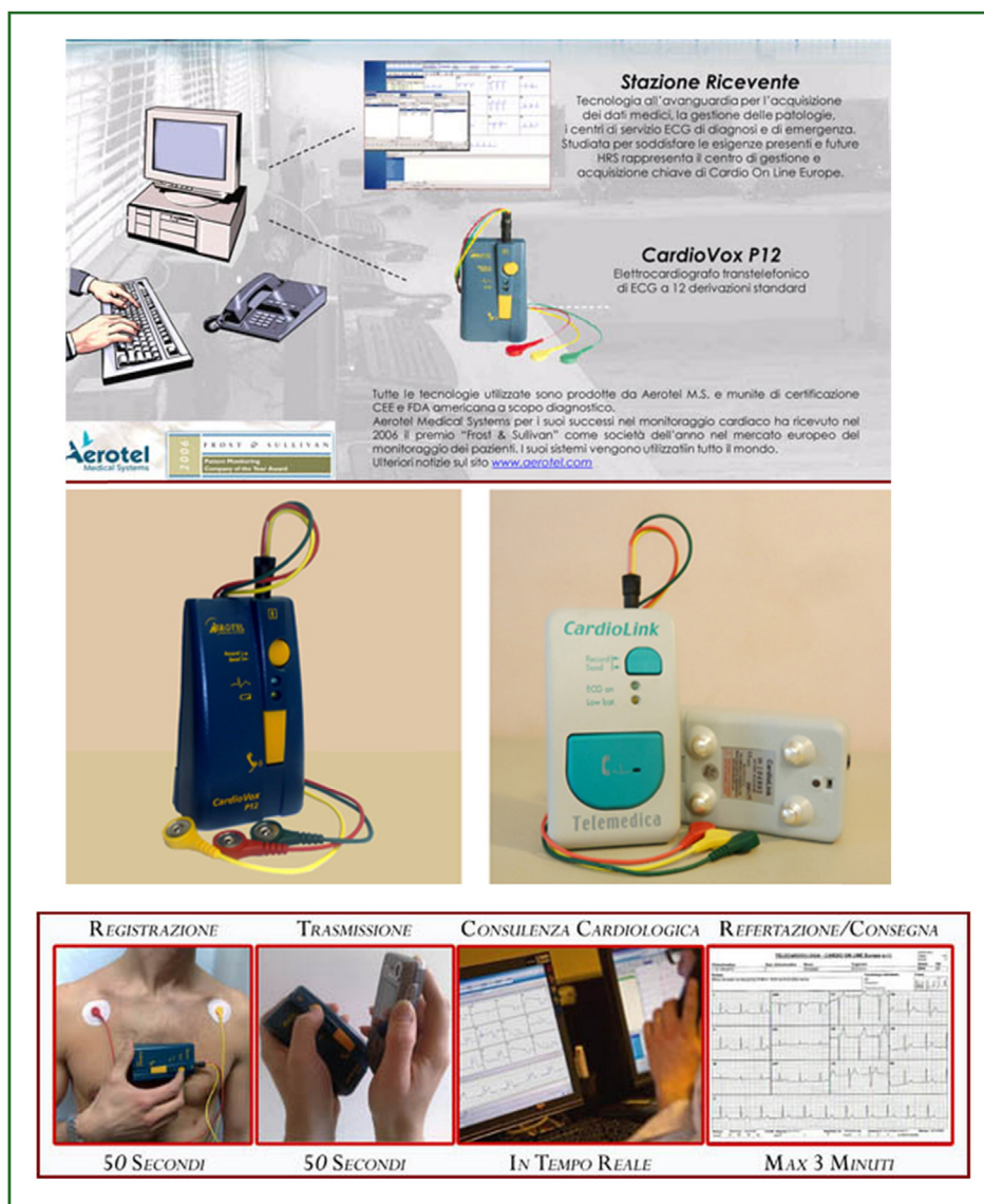
Figure 2. Telecardiology device for remote electrocardiogram recording and its use. Un dispositif de télécardiologie pour l'enregistrement des ECG à distance et son utilisation.

alternating, on duty cardiologists and an emergency power system in case of electrical power outage.